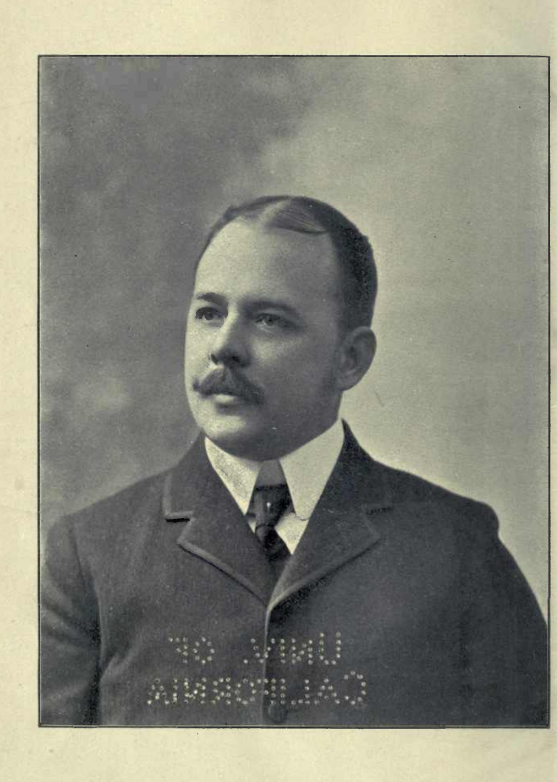
Univ Calif - Digitized by Microsoft ®