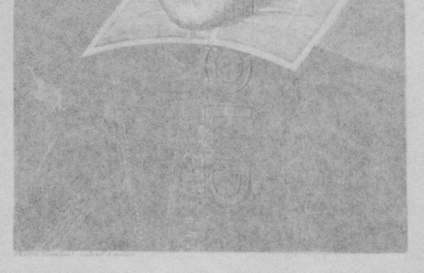
LONDON Printedby Ifaac laggard, and Ed. Blower comp