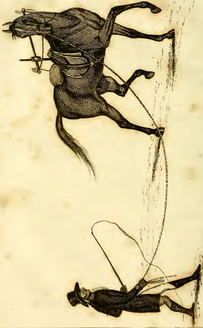
An Improvement on the Cross.

Printed and Published by J. G. S. & Co. No. 10, South Street, New York.