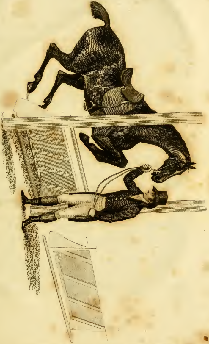
Leading a Horse to Work.