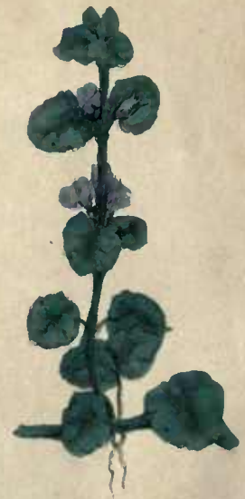
Alehoof or Ground Ivy