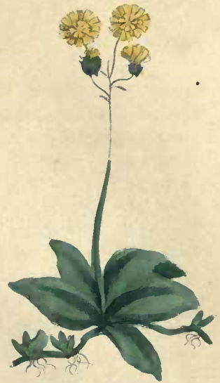
Mouse ear Hawkweed.