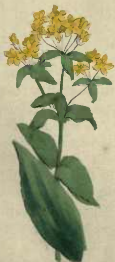
Loosetrife or Willowherb