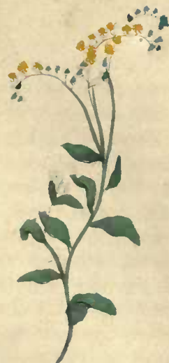
Field Mouse Ear