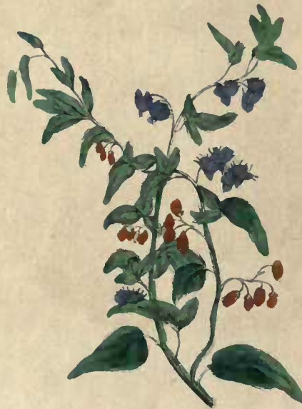
Anara Dulcis or Bitter Sweet