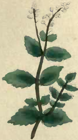
Queen of the Meadow