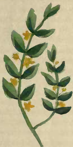
Yellow Money wort