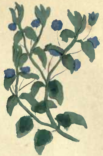
Loosestrife or Wood Willow-herb