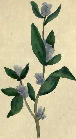
Pellitory of the Wall