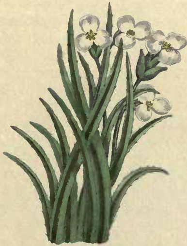
Crabs Claws or Fresh water Soldier