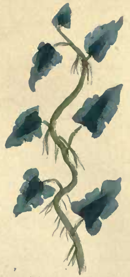
Bistort or Snakeweed