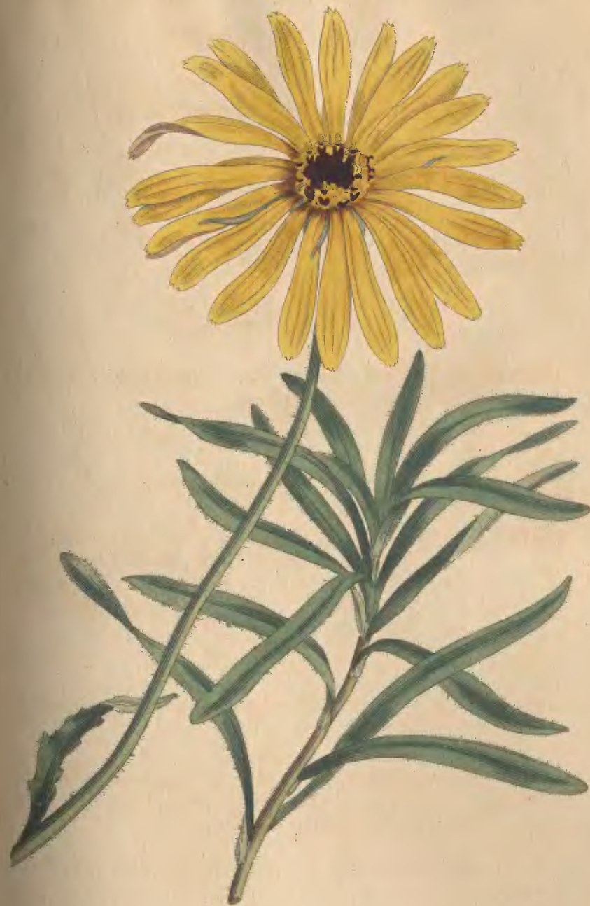
Pub. by W. Curtis Sculp. Crispine May. 1798.

The only account we have of this plant is in the Hort. Kew. of Mr. AITON, where it is first described.