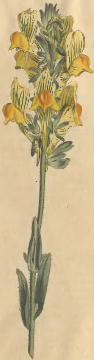
Pub. by W. Curtis. St. Geo. Croicent. April. 1797.