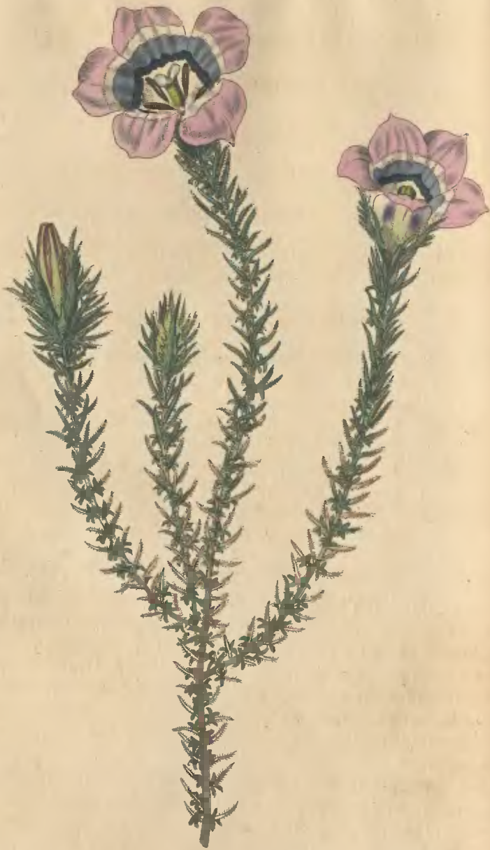
Pub. by W. Curtis Scilicet. Crescent July 1797