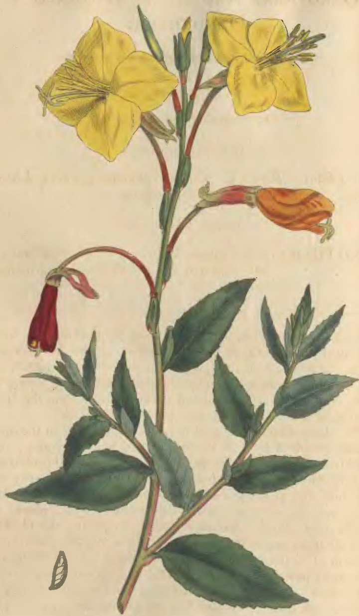
Pub. by W. Curtis, Sc. Geo. Convent. Nov. 1797