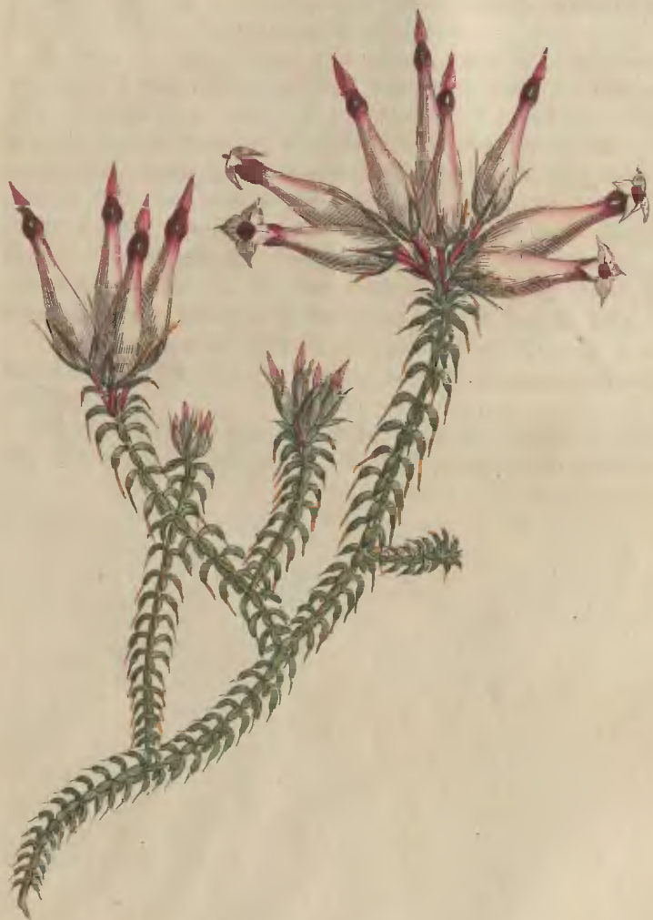
Pub. by W. Curtis's "Gen. Criscent Feb. 1797.