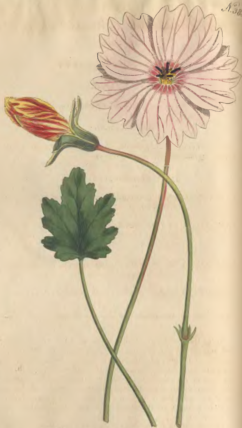
Pub. by W. Curtis Sc. Gen. Crescent Oct. 1. 1797