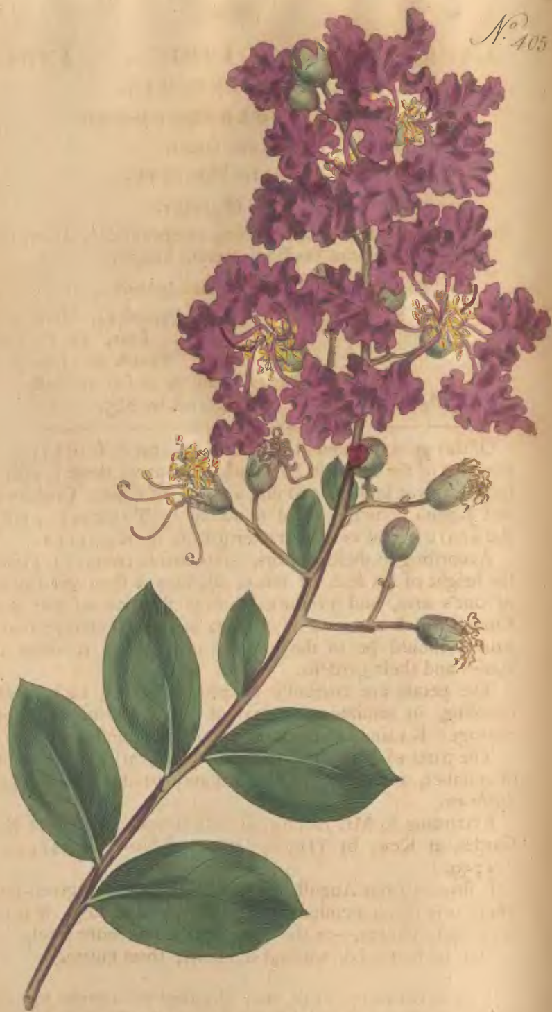
Pub. by W. Curtis del. Geo. Crisp fecit. Apr. 1. 1798.