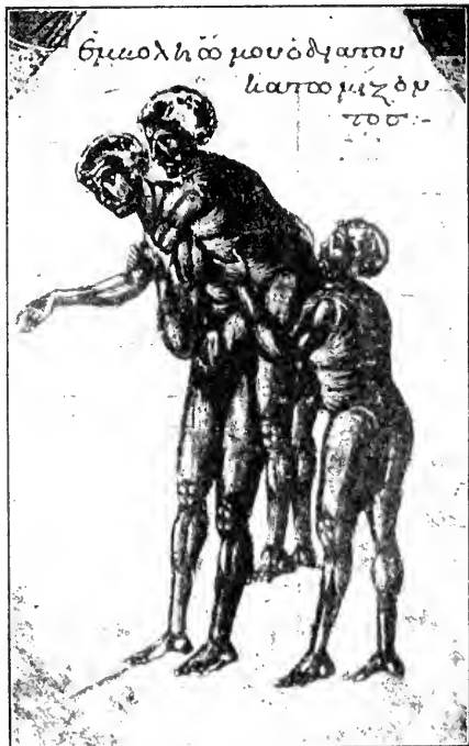
REDUCTION OF THE SHOULDER JOINT.