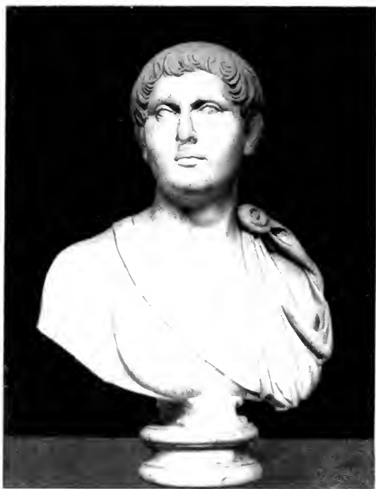
GERMANICUS CAESAR. CAPITOLINE MUSEUM, ROME