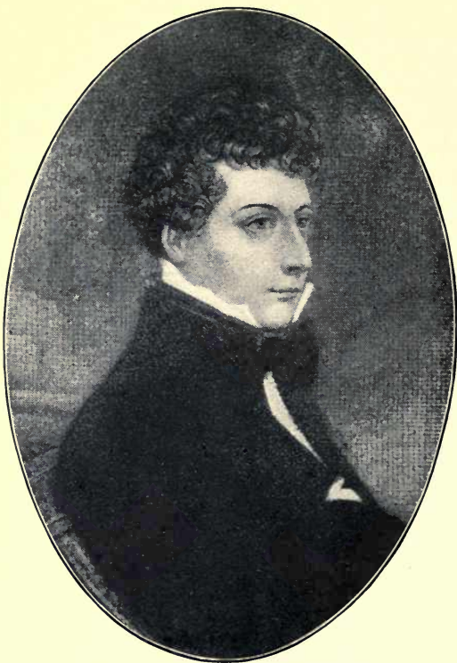
THEOBALD WOLFE TONE

"The connection between Great Britain and Ireland is the curse of the Irish nation, while it lasts my country cannot be free nor happy. Success in the eyes of the vulgar, fixes its merits. Washington succeeded, while Kosciusko failed. I await the Death which awaits me."