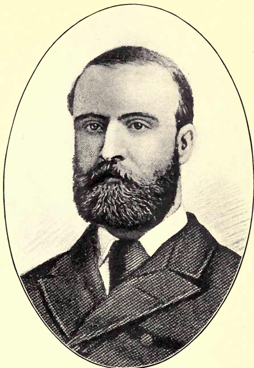
CHARLES STEWART PARNELL

"Ireland a nation—free and independent—is the hope and the dream of her children scattered over the globe."