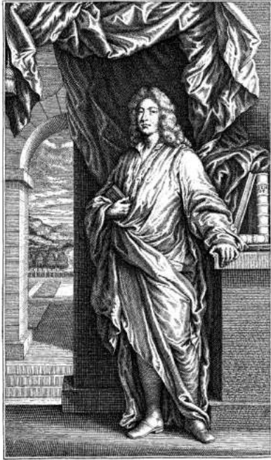
Anthony, Third Earl of Shaftesbury