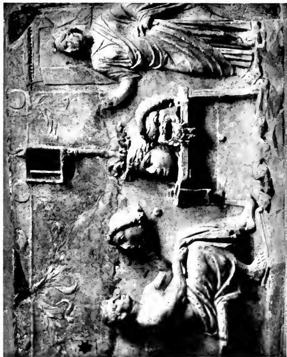
A COMIC POET REHEARSING A MASK