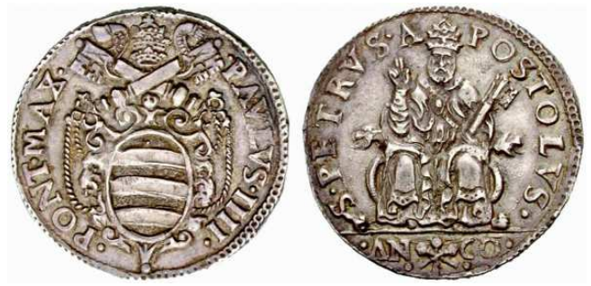
PAPAL COINS Paul IV., 1555-1559.

Estimate: 150 EUR. Price realized: 200 EUR (approx. 265 U.S. Dollars as of the auction date)