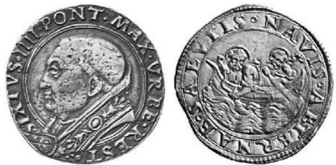
PAPAL COINS Sixtus IV., 1471-1484.