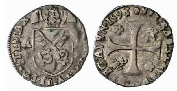
PAPAL COINS Clement VIII., 1592-1605..

Estimate CHF 400. Price realized: 320 CHF (approx. 237 U.S. Dollars as of the auction date)