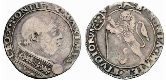
PAPAL COINS Leo X., 1513-1521.

Estimation DM 250. Price realized: 360 DEM (approx. 163 U.S. Dollars as of the auction date)