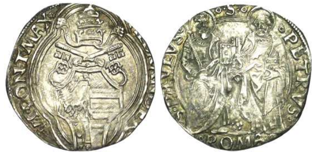
PAPAL COINS Alexander VI., 1492-1503.

Estimate: 100 EUR. Price realized: 320 EUR (approx. 423 U.S. Dollars as of the auction date)