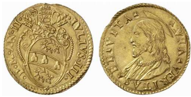
PAPAL COINS Julius III 1550-1555.

Estimated Value $4,000-4,500. Price realized: 4,400 USD.