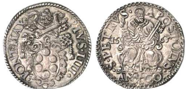
PAPAL COINS Pius IV., 1559-1565.