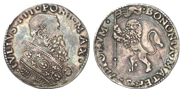
PAPAL COINS Julius III 1550-1555.

Estimate: EUR 100. Price realized: 280 EUR (approx. 353 U.S. Dollars as of the auction date)