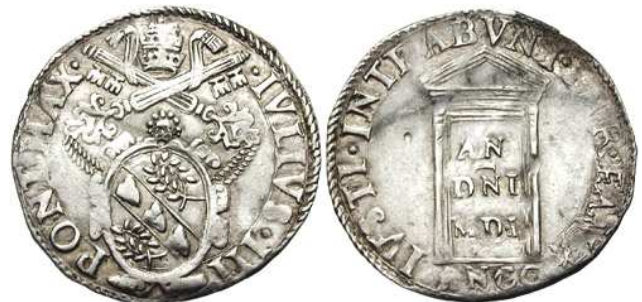
PAPAL COINS Julius III 1550-1555.

Estimate: 100.00 EUR. Price realized: 240 EUR (approx. 288 U.S. Dollars as of the auction date)