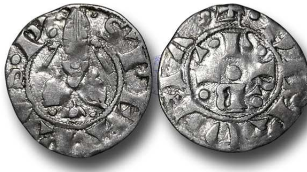
PAPAL COINS Gregory XI., 1370-1378.

Estimate CHF 350. Price realized: 480 CHF (approx. 355 U.S. Dollars as of the auction date)