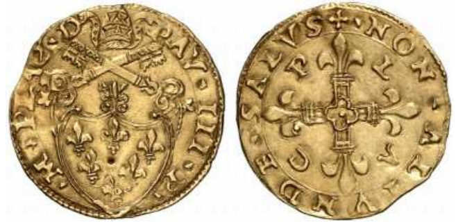
PAPAL COINS Paul III., 1534-1549.

Estimate CHF 500. Price realized: 500 CHF (approx. 392 U.S. Dollars as of the auction date)