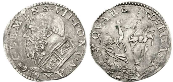
PAPAL COINS Clement VII, 1523-1534.