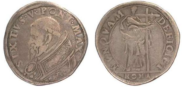
PAPAL COINS Sixtus V., 1585-1590.

Estimate: 75 EUR. Price realized: 210 EUR (approx. 322 U.S. Dollars as of the auction date)