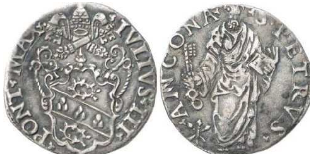
PAPAL COINS Julius III 1550-1555.

Estimate: 200 EUR. Price realized: 280 EUR (approx. 429 U.S. Dollars as of the auction date)