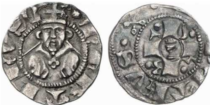
PAPAL COINS Martin V., 1417-1431.

Estimate: 350 EUR. Price realized: 625 EUR (approx. 958 U.S. Dollars as of the auction date)