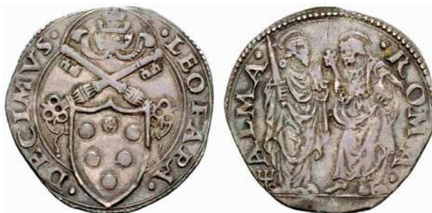
PAPAL COINS Leo X., 1513-1521.

Estimate: 2.000 EUR. Price realized: 1,600 EUR (approx. 1,925 U.S.