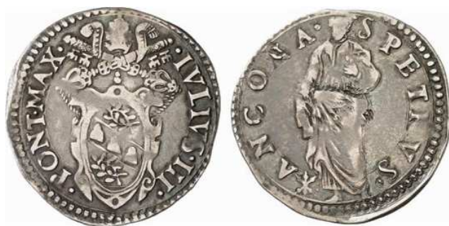
PAPAL COINS Julius III 1550-1555.