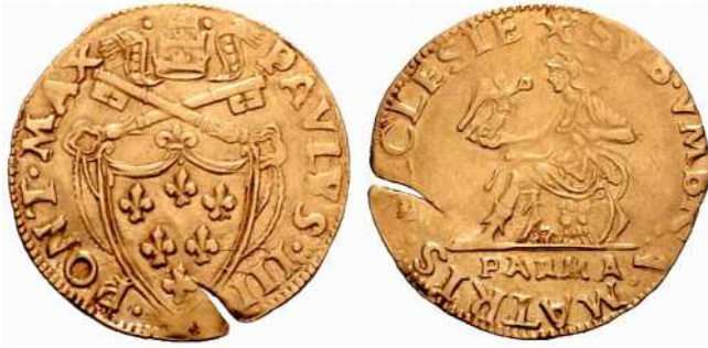
PAPAL COINS Paul III., 1534-1549.