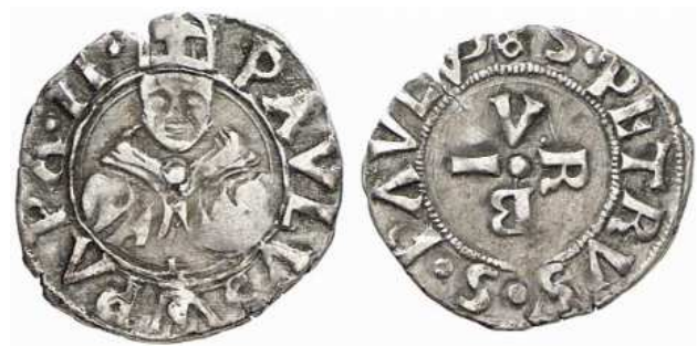
PAPAL COINS Paul II., 1464-1471.

Estimation DM 150. Price realized: 190 DEM (approx. 86 U.S. Dollars as of the auction date)