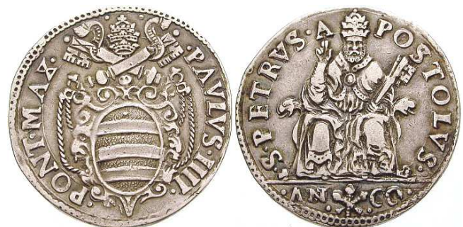
PAPAL COINS Paul IV., 1555-1559.

Estimate: 250 EUR. Price realized: 200 EUR (approx. 259 U.S. Dollars as of the auction date)