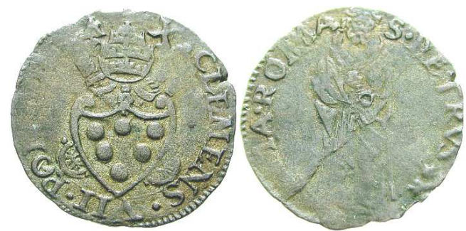
PAPAL COINS Clement VII, 1523-1534.

Estimate: 75 EUR. Price realized: 240 EUR (approx. 368 U.S. Dollars as of the auction date)