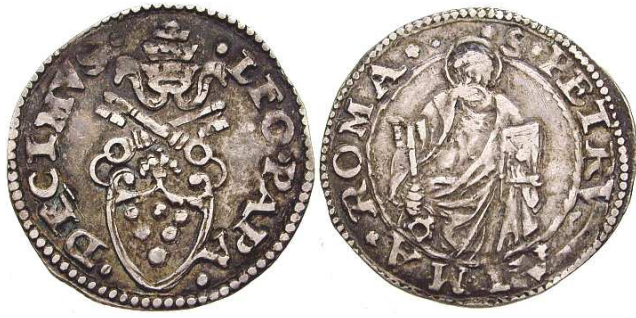
PAPAL COINS Leo X., 1513-1521.