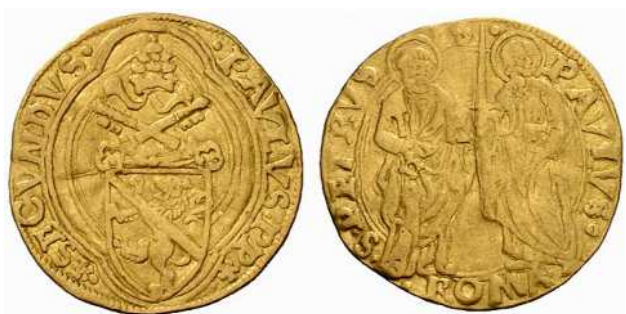
PAPAL COINS Paul II., 1464-1471.

Estimation: EUR 500. Price realized: 600 EUR (approx. 708 U.S. Dollars as of the auction date)