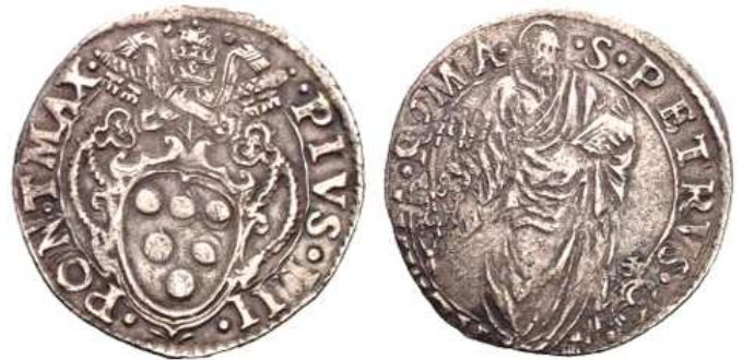
PAPAL COINS Pius IV., 1559-1565.

Estimation DM 200. Price realized: 160 DEM (approx. 73 U.S. Dollars as of the auction date)