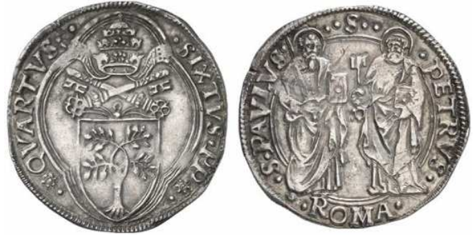
PAPAL COINS Sixtus IV., 1471-1484.

Estimation DM 350. Price realized: 700 DEM (approx. 318 U.S. Dollars as of the auction date)