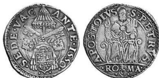
PAPAL COINS Sede Vacante 1559.

Estimate: 200.00 EUR. Price realized: 360 EUR (approx. 432 U.S. Dollars as of the auction date)