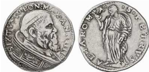
PAPAL COINS Sixtus V., 1585-1590.

Estimation: £ 40. Price realized: 70 GBP (approx. 100 U.S. Dollars as of the auction date)