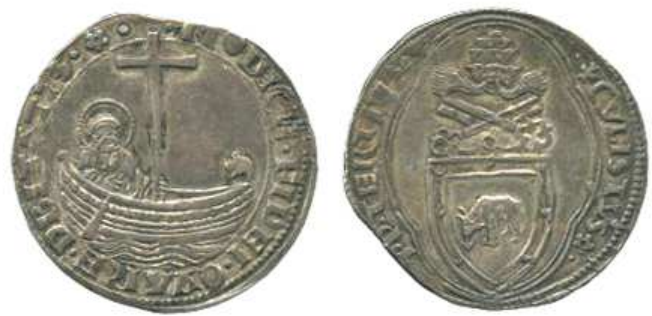
PAPAL COINS Calixtus III., 1455-1458.

Estimation DM 100. Price realized: 950 DEM (approx. 431 U.S. Dollars as of the auction date)