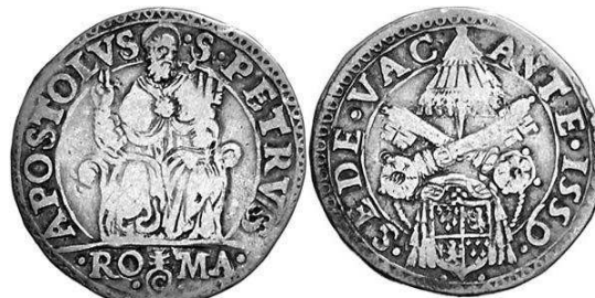
PAPAL COINS Sede Vacante 1559.