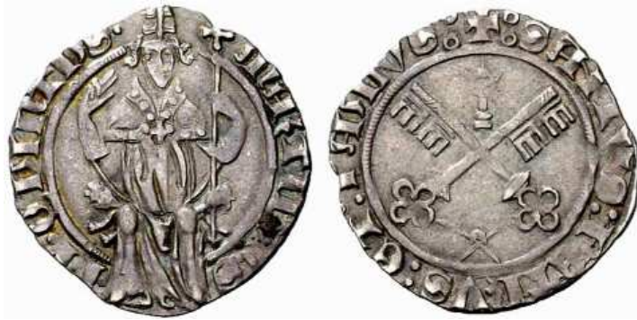
PAPAL COINS Martin V., 1417-1431.