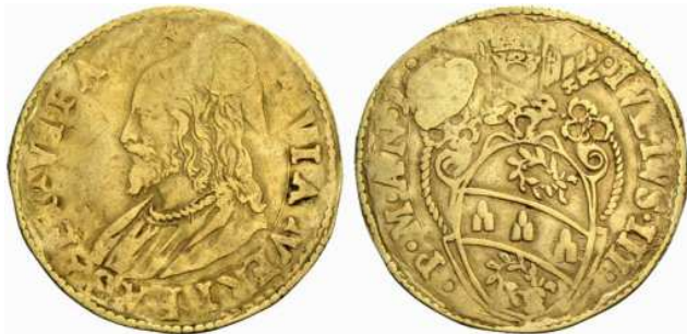
PAPAL COINS Julius III 1550-1555.

Estimation CHF 2000. Price realized: 2,600 CHF (approx. 1,974 U.S. Dollars as of the auction date)