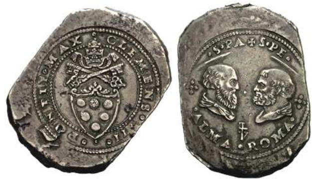
PAPAL COINS Clement VII, 1523-1534.

Estimate CHF 40000. Price realized: 47,000 CHF (approx. 39,170 U.S. Dollars as of the auction date)