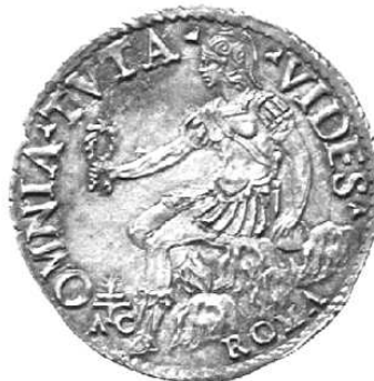
PAPAL COINS Julius III 1550-1555.