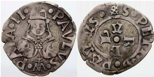
PAPAL COINS Paul II., 1464-1471.

Estimate: 100 EUR. Price realized: 380 EUR (approx. 582 U.S. Dollars as of the auction date)