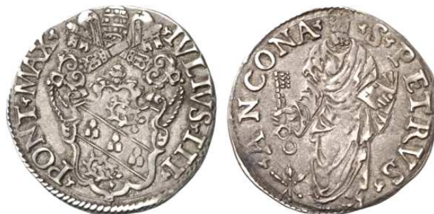
PAPAL COINS Julius III 1550-1555.

Schätzpreis: 100.00 EUR. Price realized: 115 EUR (approx. 138 U.S. Dollars as of the auction date)