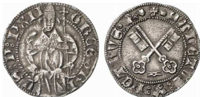
PAPAL COINS Gregory XII., 1406-1417.