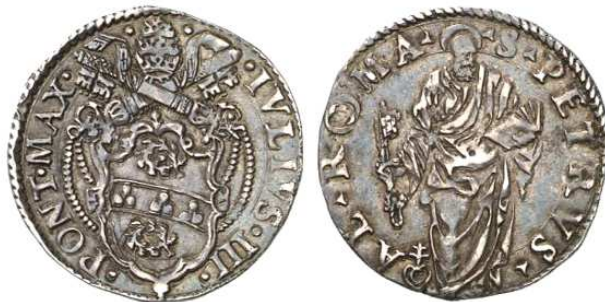
PAPAL COINS Julius III 1550-1555.

Starting Price EUR 75. Price realized: 130 EUR (approx. 190 U.S. Dollars as of the auction date)