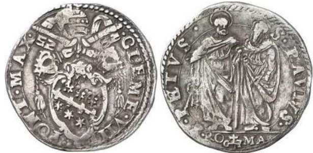
PAPAL COINS Clement VIII., 1592-1605..

Estimate: EUR 180. Price realized: 130 EUR (approx. 193 U.S. Dollars as of the auction date)