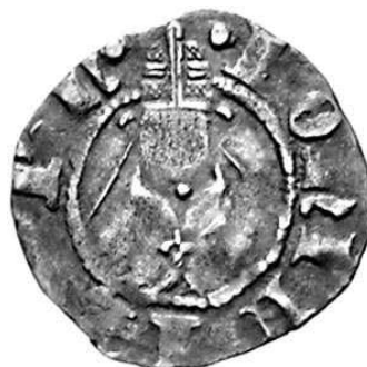
PAPAL COINS Boniface IX., 1389-1404.