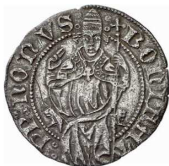
PAPAL COINS Boniface IX., 1389-1404.

(Note on numbering: Pope Boniface VII is now considered an anti-pope. At the time however, this fact was not recognized and so the seventh true Pope Boniface took the official number VIII. This caused the true eighth Pope Boniface to take the number IX. This has advanced the numbering of all subsequent Popes Boniface by one. Popes Boniface VIII-IX are really the seventh through eight popes by that name.)