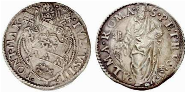
PAPAL COINS Julius III 1550-1555.