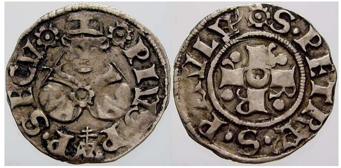
PAPAL COINS Pius II., 1458-1464.

Estimation DM 100. Price realized: 290 DEM (approx. 132 U.S. Dollars as of the auction date)