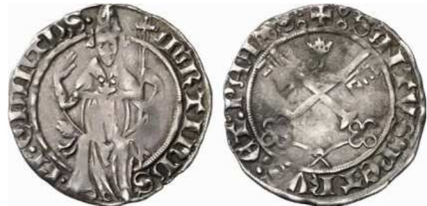
PAPAL COINS Martin V., 1417-1431.