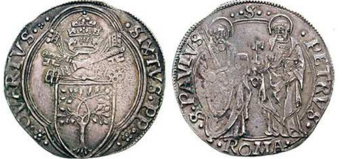
PAPAL COINS Sixtus IV., 1471-1484.

Estimate: EUR 30. Price realized: 230 EUR (approx. 276 U.S. Dollars as of the auction date)