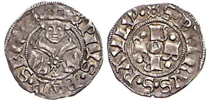
PAPAL COINS Pius II., 1458-1464.

Estimation CHF 250. Price realized: 275 CHF (approx. 207 U.S. Dollars as of the auction date)