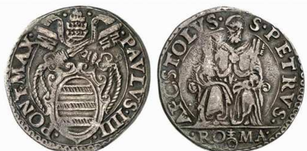
PAPAL COINS Paul IV., 1555-1559.

Estimate: 100 EUR. Price realized: 80 EUR (approx. 123 U.S. Dollars as of the auction date)