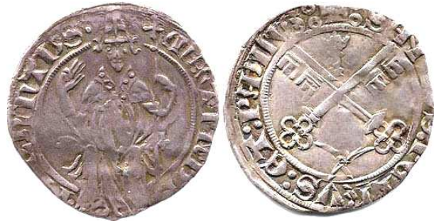
PAPAL COINS Martin V., 1417-1431.

Estimate: 500 EUR. Price realized: 420 EUR (approx. 555 U.S. Dollars as of the auction date)