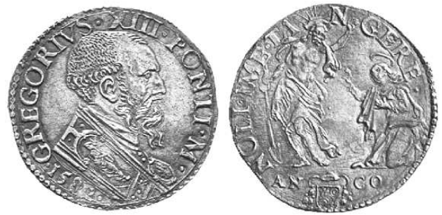
PAPAL COINS Gregory XIII., 1572-1585.