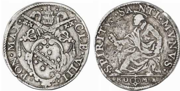
PAPAL COINS Clement VIII., 1592-1605..

Estimation: 125,00. Price realized: 230 EUR (approx. 289 U.S. Dollars as of the auction date)