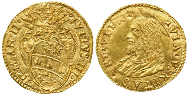
PAPAL COINS Julius III 1550-1555.

Scudo D'Oro. Year 2 Rome mint. 22.45 mm 3.37 g.