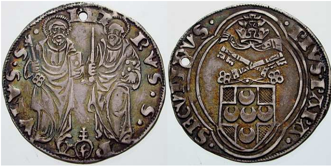
PAPAL COINS Pius II., 1458-1464.