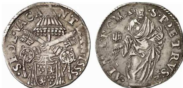
PAPAL COINS Sede Vacante 1555.