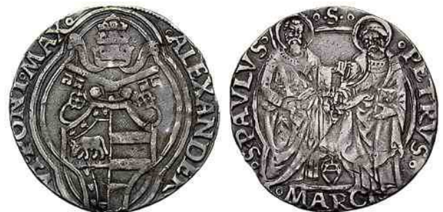
PAPAL COINS Alexander VI., 1492-1503.