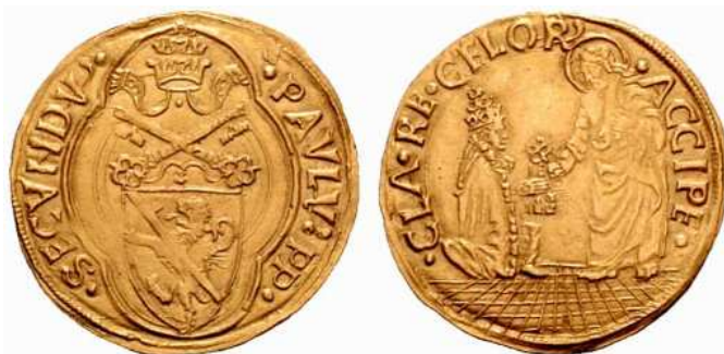
PAPAL COINS Paul II., 1464-1471.

Estimate: 1250 EUR. Price realized: 1,900 EUR (approx. 2,912 U.S. Dollars as of the auction date)