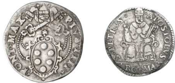
PAPAL COINS Pius IV., 1559-1565.

Estimation DM 250. Price realized: 200 DEM (approx. 91 U.S. Dollars as of the auction date)