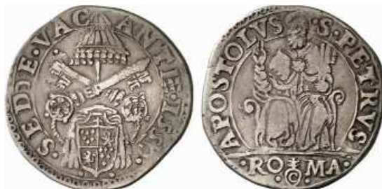
PAPAL COINS Sede Vacante 1559.