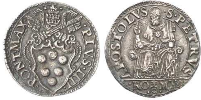
PAPAL COINS Pius IV., 1559-1565.

Estimate £ 250-300. Price realized: 220 GBP (approx. 365 U.S. Dollars as of the auction date)