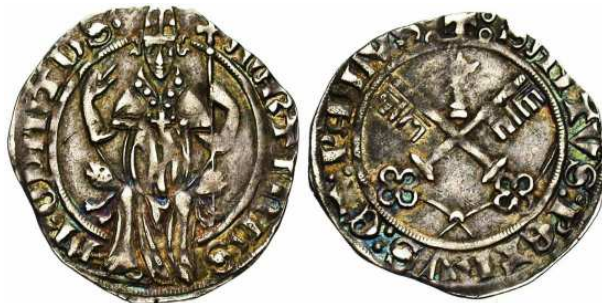
PAPAL COINS Martin V., 1417-1431.