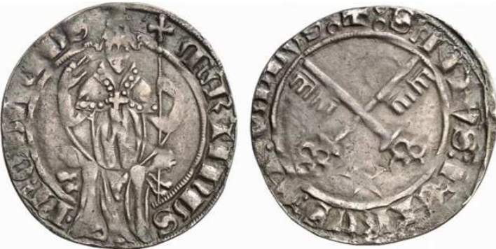
PAPAL COINS Martin V., 1417-1431.

Estimate: EUR 200. Price realized: 300 EUR (approx. 445 U.S. Dollars as of the auction date)