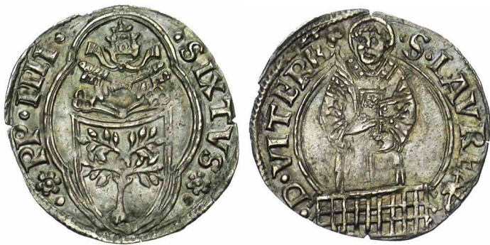
PAPAL COINS Sixtus IV., 1471-1484.