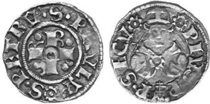
PAPAL COINS Pius II., 1458-1464.

Estimation DM 150. Price realized: 260 DEM (approx. 118 U.S. Dollars as of the auction date)