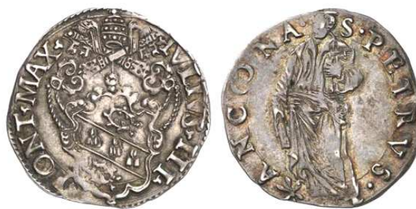
PAPAL COINS Julius III 1550-1555.

Estimate: 75 EUR. Price realized: 120 EUR (approx. 184 U.S. Dollars as of the auction date)