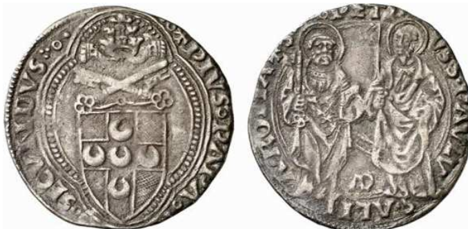
PAPAL COINS Pius II., 1458-1464.

Estimate CHF 250. Price realized: 400 CHF (approx. 296 U.S. Dollars as of the auction date)