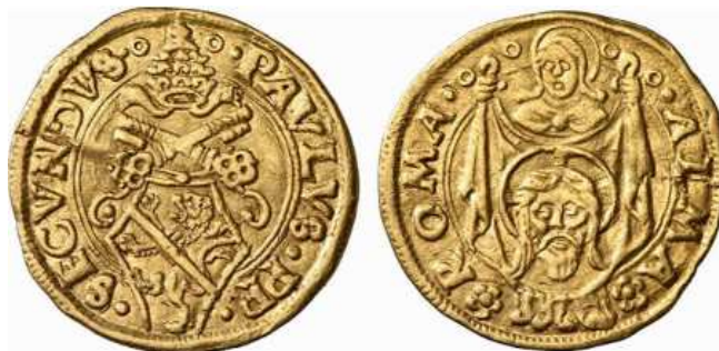
PAPAL COINS Paul II., 1464-1471.